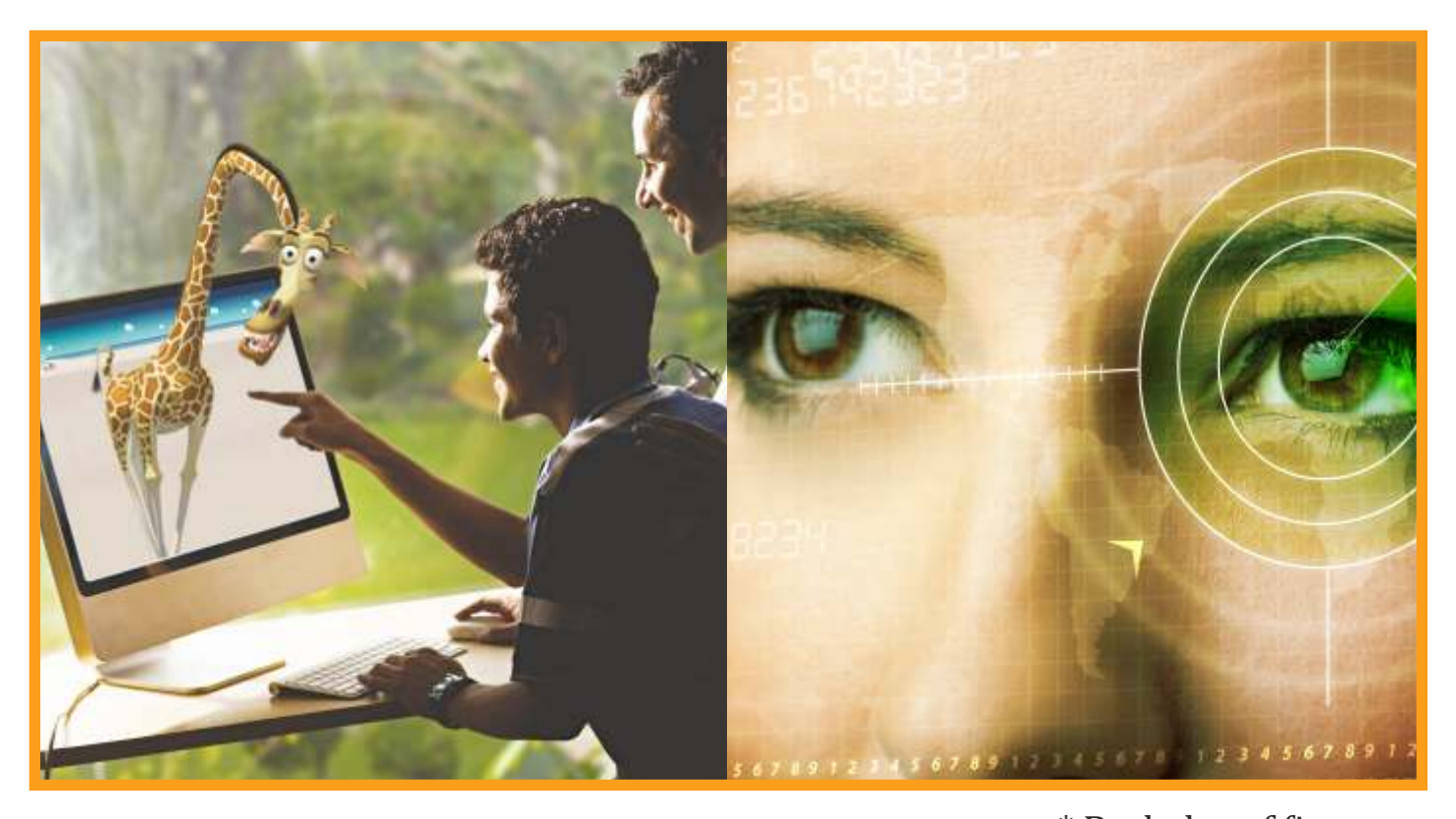
* Bachelor of fine arts